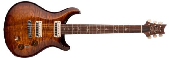
Black Gold Burst , Charcoal, Dark Cherry Burst, Faded Blue Jean, Red Tiger, Yellow Tiger

THESE MODELS ARE NO LONGER AVAILABLE FOR ORDER. DUE TO OUR BACKLOG, THEY WILL CONTINUE SHIPPING THROUGH 2023 AND MAY BE AVAILABLE FROM OUR AUTHORIZED DEALER NETWORK.