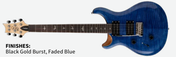
FINISHES: Black Gold Burst, Faded Blue

Maple top with flame maple veneer, shallow violin carve, mahogany back, 25" scale length, 24 fret maple neck, rosewood fretboard, bird inlays, PRS patented molded tremolo, 85/15 "S" treble and bass pickups, volume & push/pull tone controls with 3-way blade pickup switch, PRS-Designed tuners, nickel hardware, gig bag • Neck profile: wide thin