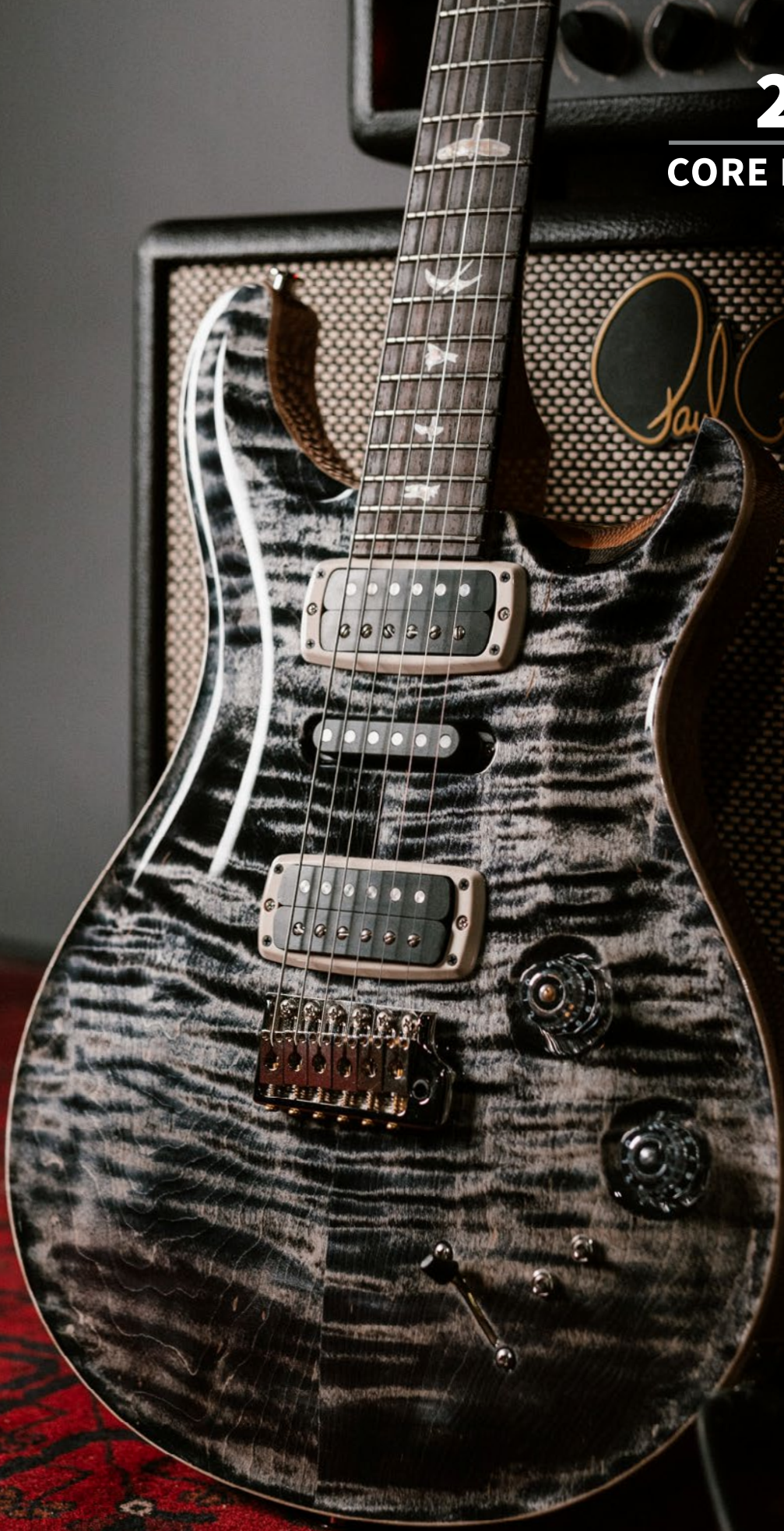
MODERN EAGLE V // Shown in Charcoal