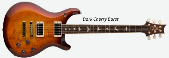
Dark Cherry Burst

Asymmetric bevel-cut maple top, mahogany back, 24.594" scale length, 22 fret mahogany neck, rosewood fretboard with faux bone binding, bird inlays, 58/15 LT "S" treble and bass pickups, volume & push/pull tone controls for each pickup with 3-way toggle pickup switch on upper bout, PRS two-piece bridge, PRS vintage-style tuners, nickel hardware, gig bag • Neck profile: Pattern Vintage