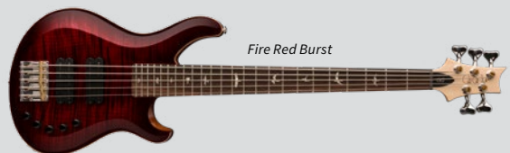
Fire Red Burst