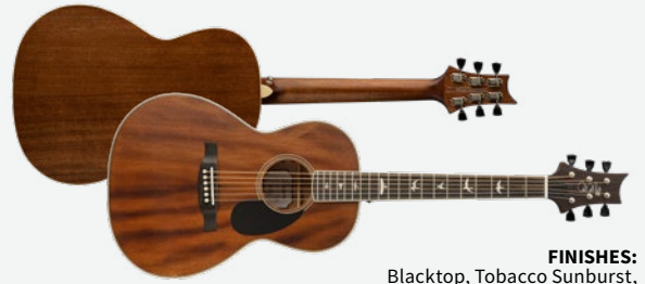
FINISHES: Blacktop, Tobacco Sunburst, Vintage Mahogany