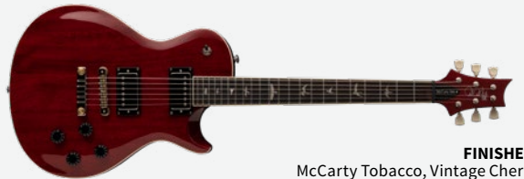
FINISHES: McCarty Tobacco, Vintage Cherry