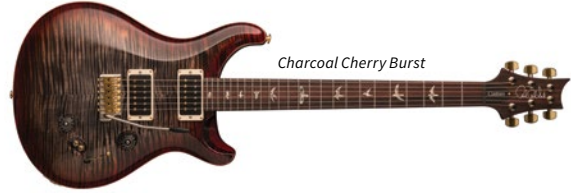
Charcoal Cherry Burst