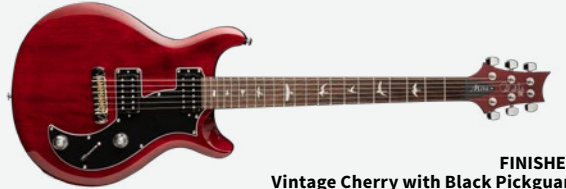
FINISHES: Vintage Cherry with Black Pickguard