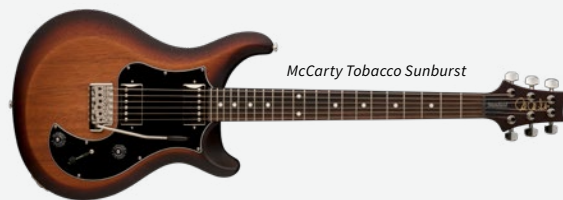
McCarty Tobacco Sunburst