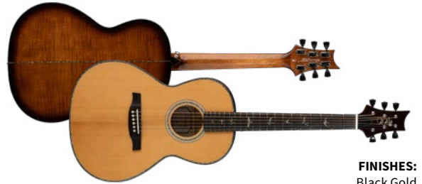
FINISHES: Black Gold