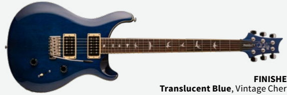
FINISHES: Translucent Blue, Vintage Cherry