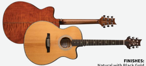
FINISHES: Natural with Black Gold