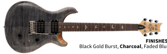
FINISHES: Black Gold Burst, Charcoal , Faded Blue

Maple top with flame maple veneer, shallow violin carve, mahogany back, 25" scale length, 24 fret maple neck, rosewood fretboard, bird inlays, PRS patented molded tremolo, 85/15 "S" treble & bass pickups, volume & push/pull tone controls with 3-way blade pickup selector, PRS-Designed tuners, nickel hardware, gig bag • Neck profile: wide thin