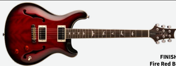
FINISHES: Fire Red Burst

5-ply laminated bound mahogany top and back, mahogany middle, 25" scale length, 22 fret bound mahogany neck, ebony fretboard, bird inlays, PRS adjustable stoptail, 58/15 LT "S" treble and bass pickups, volume & tone controls with 3-way toggle pickup switch, PRS-Designed tuners, nickel hardware, hardshell case • Neck profile : wide fat