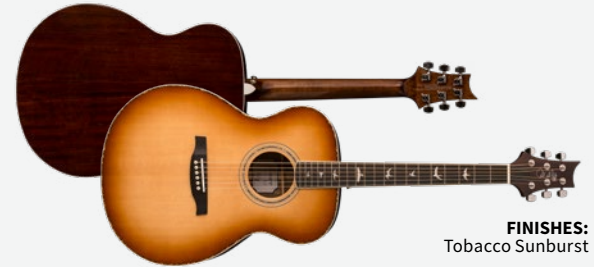
FINISHES: Tobacco Sunburst