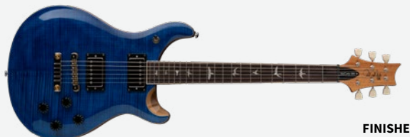
FINISHES: Black Gold Burst, Faded Blue, Vintage Sunburst