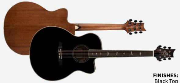
FINISHES: Black Top