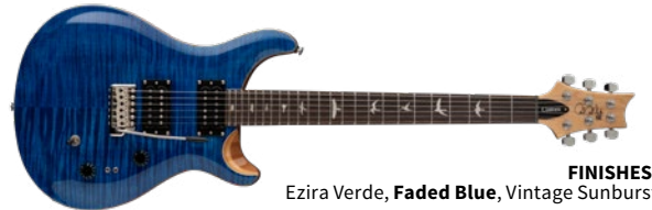
FINISHES: Ezira Verde, Faded Blue , Vintage Sunburst

Maple top with flame maple veneer, shallow violin carve, mahogany back, 25" scale length, 24 fret maple neck, rosewood fretboard, bird inlays, PRS patented molded tremolo, TCI "S" treble and bass pickups, volume and tone controls with 3-way toggle pickup switch & two mini-toggle coil-split switches, PRS-Designed tuners, nickel hardware, gig bag • Neck profile: wide thin