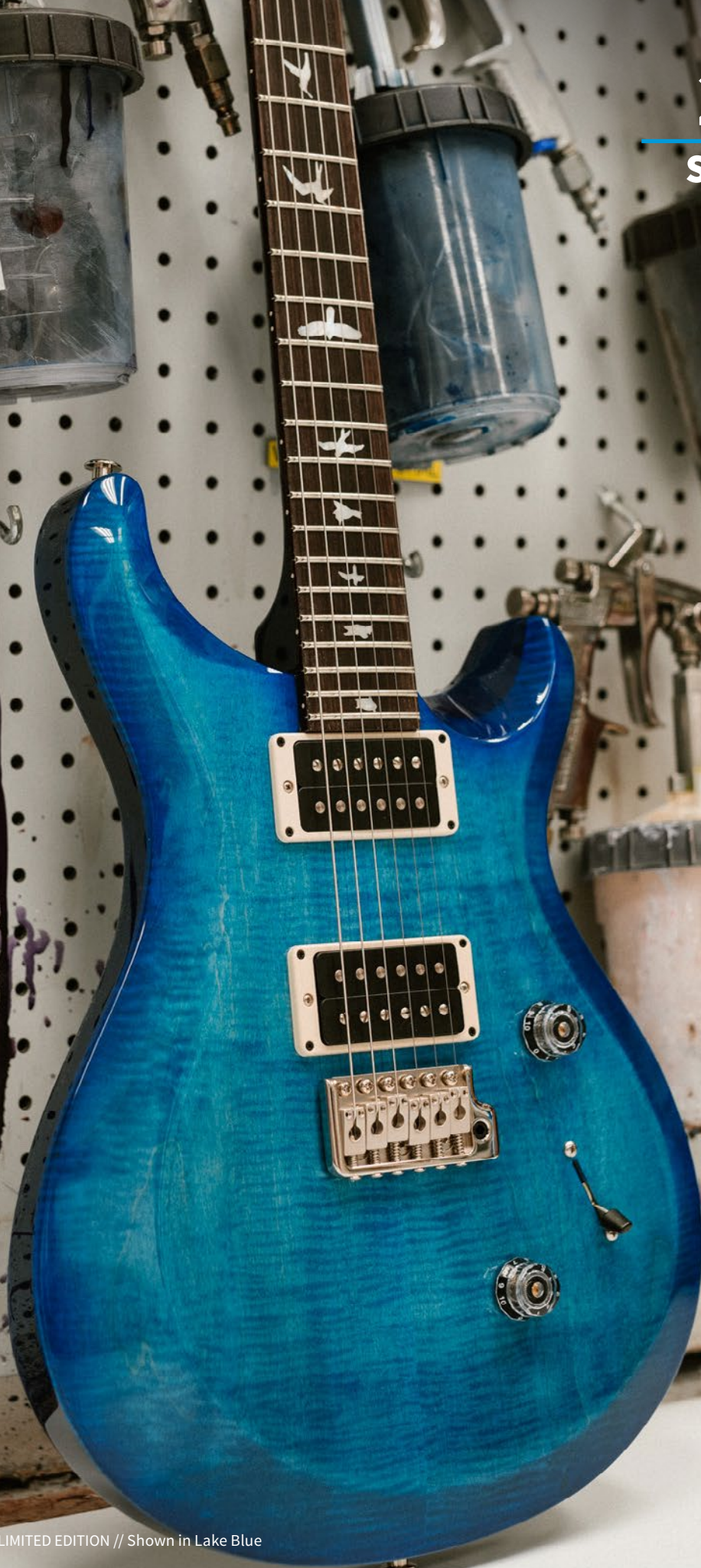
10TH ANNIVERSARY S2 CUSTOM 24 LIMITED EDITION // Shown in Lake Blue