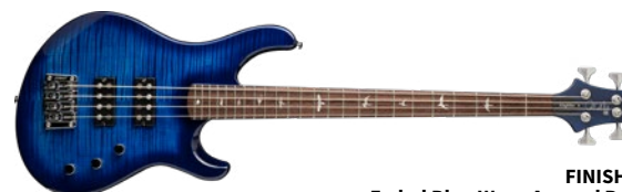
FINISHES: Faded Blue Wrap Around Burst

5-ply maple/walnut neck through body, swamp ash body wings, flame maple veneer, 34" scale length, 24 frets, rosewood fretboard, bird inlays, Hipshot Transtone bridge, Hipshot HB6 tuners, PRS-Designed 4B 'H' pickups, 2 volume & 1 tone control, gig bag • Neck profile: SE bass 4