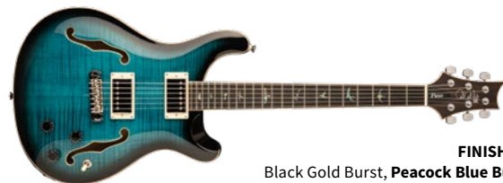
FINISHES: Black Gold Burst, Peacock Blue Burst

5-ply laminated maple top and back with flame maple veneers, mahogany middle, 25" scale length, 22 fret bound mahogany neck, ebony fretboard, bird inlays, PRS adjustable piezo stoptail, 58/15 LT "S" treble and bass pickups, magnetic volume, piezo volume, and tone control with 3-way toggle pickup selector, PRS-Designed tuners, nickel hardware, hardshell case • Neck profile : wide fat