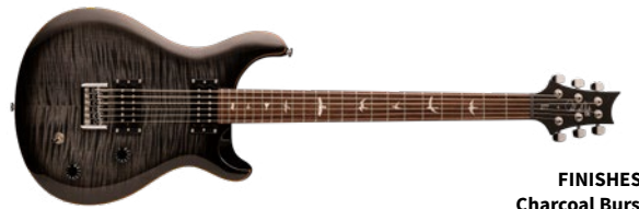
FINISHES: Charcoal Burst

Maple top with flame maple veneer, shallow violin carve, mahogany back, 27.7" scale length, 22 fret maple neck, rosewood fretboard, bird inlays, plate-style bridge (string through), 85/15 "S" treble and bass pickups, volume & push/pull tone controls with 3-way toggle pickup switch, PRS-Designed tuners, nickel hardware, gig bag • Neck profile : wide fat