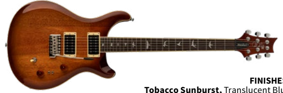
FINISHES: Tobacco Sunburst, Translucent Blue