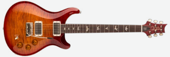
Black Gold Burst, Charcoal, Dark Cherry Burst , Faded Whale Blue, Gold Top*, McCarty Sunburst, McCarty Tobacco Sunburst