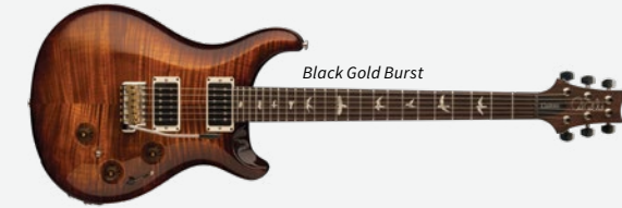
Black Gold Burst