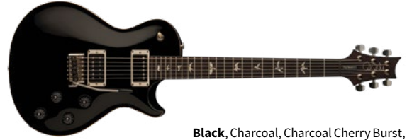
Black , Charcoal, Charcoal Cherry Burst, Charcoal Contour Burst, Cobalt Smokeburst, Faded Whale Blue, Fire Smokeburst, Purple Mist