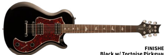
FINISHES: Black w/ Tortoise Pickguard