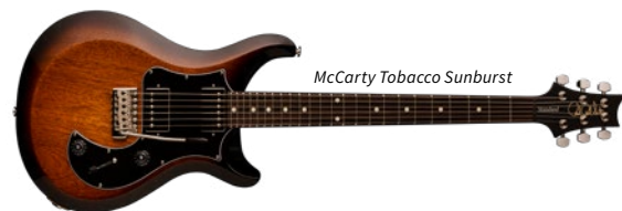
McCarty Tobacco Sunburst