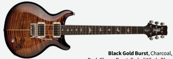
Black Gold Burst , Charcoal, Dark Cherry Burst, Faded Whale Blue, McCarty Sunburst, Orange, Santana Yellow