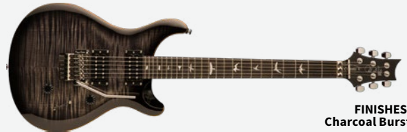
FINISHES: Charcoal Burst

Maple top with flame maple veneer, shallow violin carve, mahogany back, 25" scale length, 24 fret maple neck, ebony fretboard, bird inlays, Floyd Rose tremolo, 85/15 "S" treble and bass pickups, volume & push/pull tone controls with 3-way blade pickup switch, PRS-Designed tuners, nickel hardware, gig bag • Neck profile: wide thin