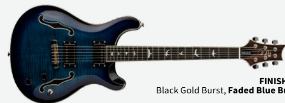
FINISHES: Black Gold Burst, Faded Blue Burst

5-ply laminated maple top and back with flame maple veneers, mahogany middle, 25" scale length, 22 fret bound mahogany neck, ebony fretboard, bird inlays, PRS adjustable stoptail, 58/15 LT "S" treble and bass pickups, volume & tone controls with 3-way toggle pickup switch, PRS-Designed tuners, nickel hardware, hardshell case • Neck profile : wide fat