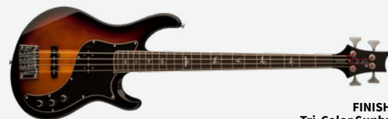
FINISHES: Tri-Color Sunburst

5-ply maple/walnut neck through body, alder body wings, 34" scale length, 22 frets, bound rosewood fretboard, bird inlays, Hipshot Transtone bridge, Hipshot HB6 tuners, PRS-Designed 4B 'S' vintage style pickups, 2 volume & 1 tone control, pickguard, gig bag • Neck profile: SE bass 4