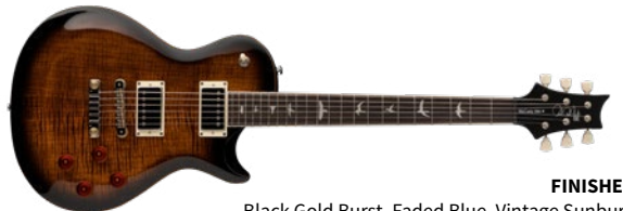
FINISHES: Black Gold Burst, Faded Blue, Vintage Sunburst