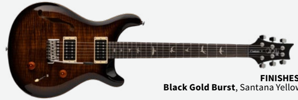
FINISHES: Black Gold Burst, Santana Yellow

Maple top with single F-hole and flame maple veneer, shallow violin carve, mahogany back, 25" scale length, 22 fret maple neck, rosewood fretboard, bird inlays, PRS patented molded tremolo, 85/15 "S" treble and bass pickups, volume & push/pull tone controls with 3-way blade pickup switch, PRS-Designed tuners, nickel hardware, gig bag • Neck profile: wide thin