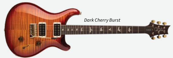
Dark Cherry Burst

Carved figured maple top, mahogany back, 25" scale length, 24 fret mahogany neck, rosewood fretboard, bird inlays, rosewood headstock veneer with inlaid signature, 85/15 treble & bass pickups, volume & tone controls with 5-way blade pickup switch, PRS patented Gen III tremolo, PRS Phase III locking tuners, nickel hardware, hardshell case • Neck profile: Pattern Thin • Options: 10 Top with Hybrid Hardware