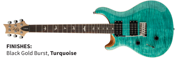
FINISHES: Black Gold Burst, Turquoise

Maple top with flame maple veneer, shallow violin carve, mahogany back, 25" scale length, 24 fret maple neck, rosewood fretboard, bird inlays, PRS patented molded tremolo, 85/15 "S" treble and bass pickups, volume & push/pull tone controls with 3-way blade pickup switch, PRS-Designed tuners, nickel hardware, gig bag • Neck profile: wide thin