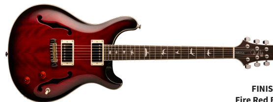
FINISHES: Fire Red Burst