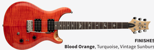
FINISHES: Blood Orange , Turquoise, Vintage Sunburst

Maple top with flame maple veneer, shallow violin carve, mahogany back, 25" scale length, 24 fret maple neck, rosewood fretboard, bird inlays, PRS patented molded tremolo, TCI "S" treble and bass pickups, volume and tone controls with 3-way toggle pickup switch & two mini-toggle coil-split switches, PRS-Designed tuners, nickel hardware, gig bag • Neck profile: wide thin