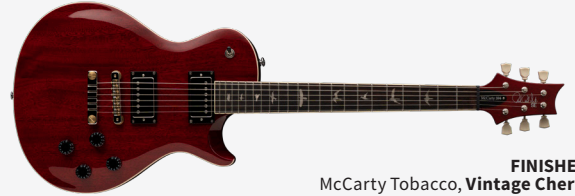
FINISHES: McCarty Tobacco, Vintage Cherry