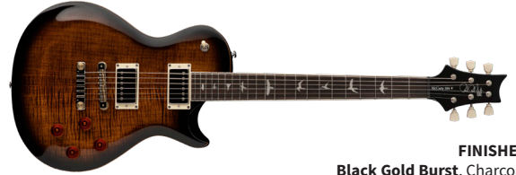
FINISHES: Black Gold Burst , Charcoal, Turquoise, Vintage Sunburst