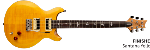
FINISHES: Santana Yellow