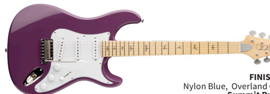
FINISHES: Nylon Blue, Overland Gray, Summit Purple