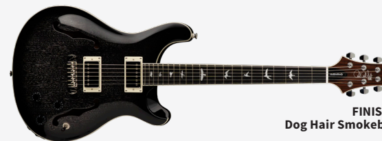
FINISHES: Dog Hair Smokeburst