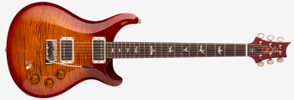
Black Gold Burst, Charcoal, Dark Cherry Burst , Faded Whale Blue, Gold Top*, McCarty Sunburst, McCarty Tobacco Sunburst