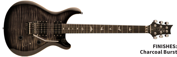
FINISHES: Charcoal Burst

Maple top with flame maple veneer, shallow violin carve, mahogany back, 25" scale length, 24 fret maple neck, ebony fretboard, bird inlays, Floyd Rose tremolo, 85/15 "S" treble and bass pickups, volume & push/pull tone controls with 3-way blade pickup switch, PRS-Designed tuners, nickel hardware, gig bag • Neck profile: wide thin