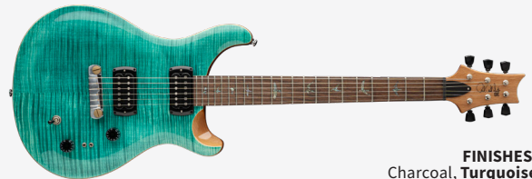
FINISHES: Charcoal, Turquoise