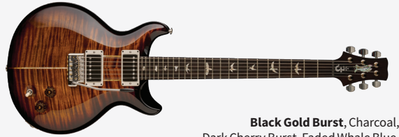
Black Gold Burst , Charcoal, Dark Cherry Burst, Faded Whale Blue, McCarty Sunburst, Orange, Santana Yellow