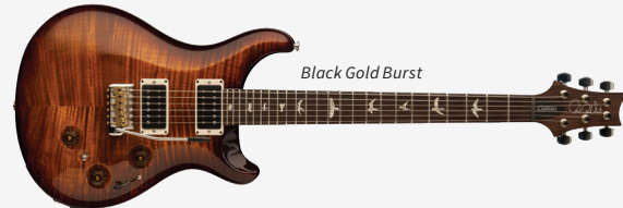
Black Gold Burst

MAPLE TOP FINISHES FOR MODELS ABOVE, *INDICATES OPAQUE COLOR Antique White*, Black*, Black Gold Burst, Charcoal, Charcoal Burst, Charcoal Cherry Burst, Cobalt Smokeburst, Dark Cherry Burst, Eriza Verde, Faded Whale Blue, Fire Smokeburst, McCarty Sunburst, Purple Mist, Yellow Tiger