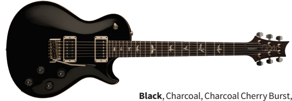
Black , Charcoal, Charcoal Cherry Burst, Charcoal Contour Burst, Cobalt Smokeburst, Faded Whale Blue, Fire Smokeburst, Purple Mist