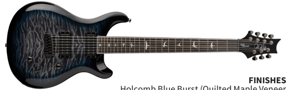
FINISHES: Holcomb Blue Burst (Quilted Maple Veneer)