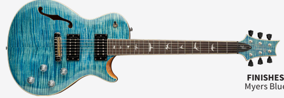
FINISHES: Myers Blue