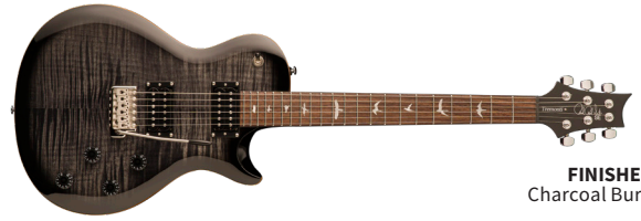
FINISHES: Charcoal Burst