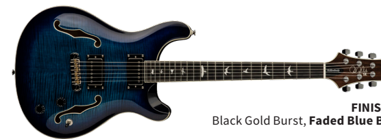
FINISHES: Black Gold Burst, Faded Blue Burst