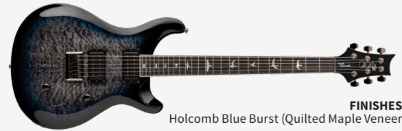
FINISHES: Holcomb Blue Burst (Quilted Maple Veneer)