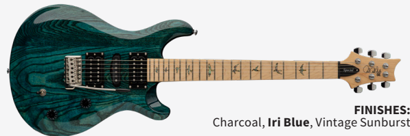
FINISHES: Charcoal, Iri Blue , Vintage Sunburst

Swamp ash body, shallow violin carve, 25" scale length, 22 fret maple neck, maple fretboard, bird inlays, PRS patented molded tremolo, 85/15 "S" treble & bass pickups, PRS-Designed AS-01 Single Coil middle pickup, volume & push/pull tone control with 3-way toggle pickup switch, PRS-Designed tuners, nickel hardware, gig bag • Neck profile: wide thin