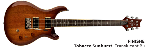
FINISHES: Tobacco Sunburst, Translucent Blue