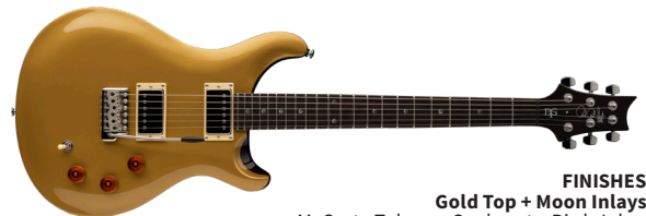
FINISHES: Gold Top + Moon Inlays, McCarty Tobacco Sunburst + Birds Inlays