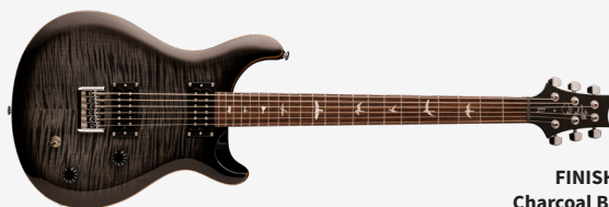
FINISHES: Charcoal Burst