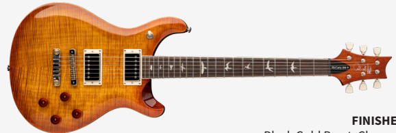
FINISHES: Black Gold Burst, Charcoal, Turquoise, Vintage Sunburst