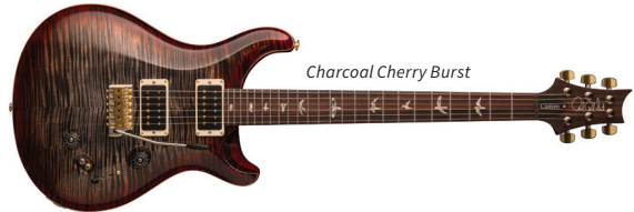
Charcoal Cherry Burst