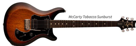
McCarty Tobacco Sunburst