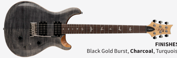
FINISHES: Black Gold Burst, Charcoal , Turquoise

Maple top with flame maple veneer, shallow violin carve, mahogany back, 25" scale length, 24 fret maple neck, rosewood fretboard, bird inlays, PRS patented molded tremolo, 85/15 "S" treble & bass pickups, volume & push/pull tone controls with 3-way blade pickup switch, PRS-Designed tuners, nickel hardware, gig bag • Neck profile: wide thin