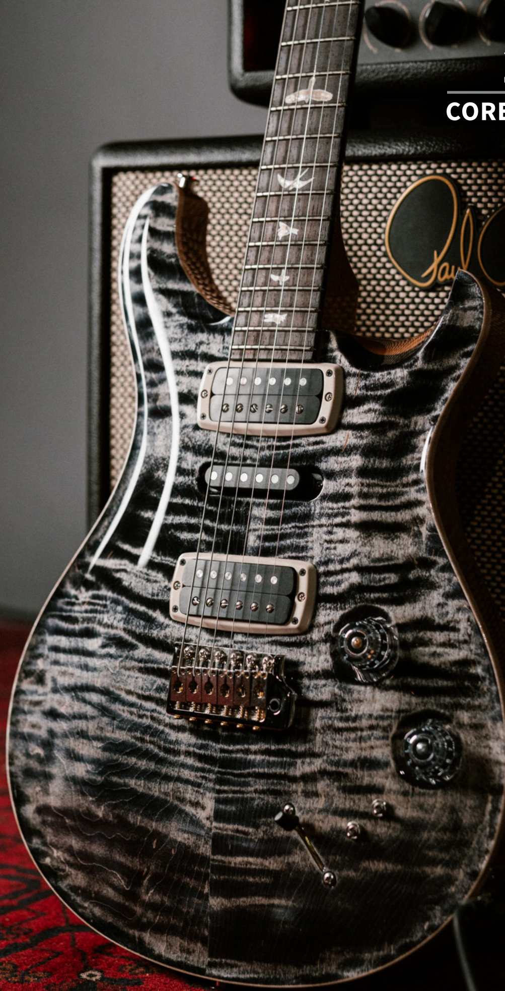
MODERN EAGLE V // Shown in Charcoal