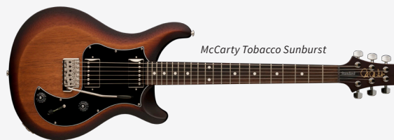
McCarty Tobacco Sunburst