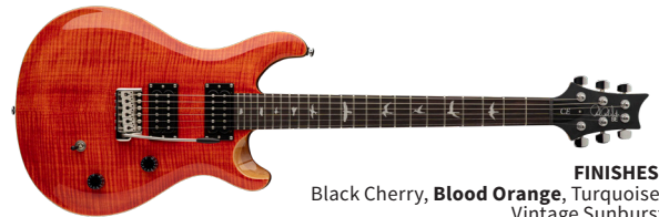
FINISHES: Black Cherry, Blood Orange , Turquoise, Vintage Sunburst