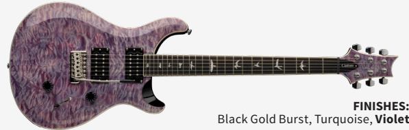
FINISHES: Black Gold Burst, Turquoise, Violet

Maple top with quilted maple veneer, shallow violin carve, mahogany back, 25" scale length, 24 fret maple neck, ebony fretboard, bird inlays, PRS patented molded tremolo, 85/15 "S" treble & bass pickups, volume & push/pull tone control with 3-way blade pickup switch, PRS-Designed tuners, nickel hardware, gig bag • Neck profile: wide thin