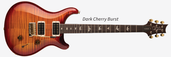
Dark Cherry Burst