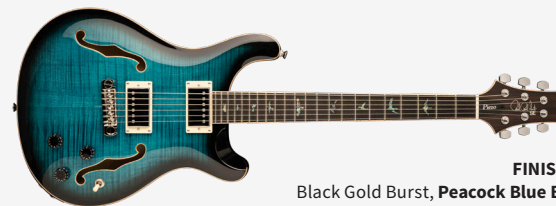
FINISHES: Black Gold Burst, Peacock Blue Burst