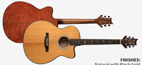
FINISHES: Natural with Black Gold