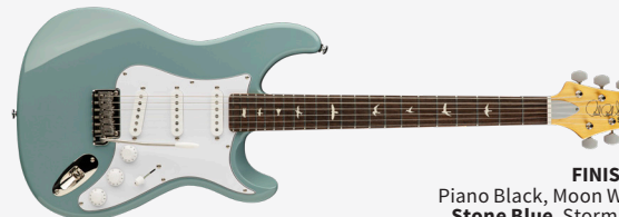
FINISHES: Piano Black, Moon White, Stone Blue, Storm Gray