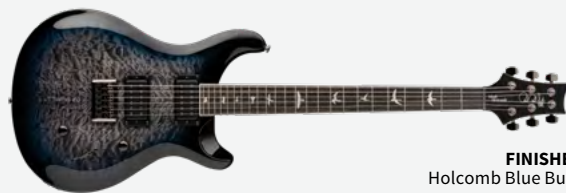
FINISHES: Holcomb Blue Burst

Maple top with quilted maple veneer, shallow violin carve, mahogany back, 26.5" scale length, 24 fret bound maple neck with satin finish, ebony fretboard, bird inlays, plate style bridge (string through), Seymour Duncan Holcomb "Scarlet and Scourge" bass and treble pickups, volume & push/pull tone controls with 3-way blade pickup switch, PRS-Designed tuners, black hardware, gig bag