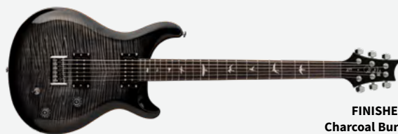
FINISHES: Charcoal Burst