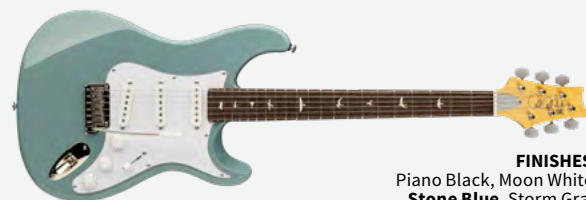
FINISHES: Piano Black, Moon White, Stone Blue , Storm Gray

Poplar body, 25.5" scale length, 22 fret maple neck, maple fretboard, small bird inlays, PRS 2-point steel tremolo, 635JM "S" treble, middle, and bass single-coil pickups, one volume & two tone controls with 5-way blade pickup switch, vintage-style tuners, nickel hardware, gig bag