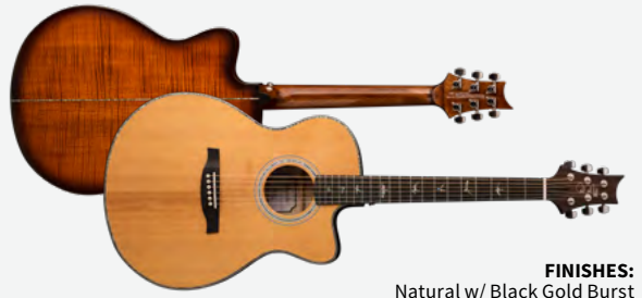
FINISHES: Natural w/ Black Gold Burst