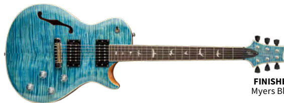
FINISHES: Myers Blue

Maple top with single F-hole and flame maple veneer, shallow violin carve, mahogany back, 24.594" scale length, 22 fret bound mahogany neck with satin finish, flame maple bound headstock veneer, bound rosewood fretboard, bird inlays, PRS adjustable stoptail, 245 "S" treble and bass pickups, volume & tone controls for each pickup with 3-way toggle pickup switch on upper bout, vintage-style tuners, nickel hardware, gig bag