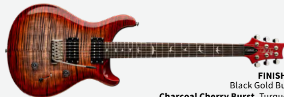
FINISHES: Black Gold Burst, Charcoal Cherry Burst , Turquoise

Maple top with flame maple veneer, shallow violin carve, mahogany back, 25" scale length, 24 fret maple neck, rosewood fretboard, bird inlays, PRS patented tremolo, 85/15 "S" treble and bass pickups, volume & push/pull tone controls with 3-way blade pickup switch, PRS-Designed tuners, nickel hardware, gig bag