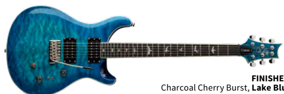
FINISHES: Charcoal Cherry Burst, Lake Blue

Maple top with single f-hole and flame maple veneer, shallow violin carve, mahogany back, 25" scale length, 24 fret maple neck, rosewood fretboard, bird inlays, PRS patented piezo tremolo, 85/15 "S" treble and bass pickups, piezo volume, magnetic volume & push/pull tone control w/ 3-way blade pickup switch, PRS designed tuners, nickel hardware, gig bag