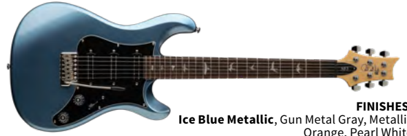
FINISHES: Ice Blue Metallic , Gun Metal Gray, Metallic Orange, Pearl White

Poplar Body, 25" scale length, 22 fret maple neck, rosewood fretboard, bird inlays, PRS patented tremolo, PRS Narrowfield DD "S" treble/middle/bass pickups, volume & tone control with 5-way blade pickup switch, PRS Designed tuners, nickel hardware, gig bag • Neck profile: wide thin