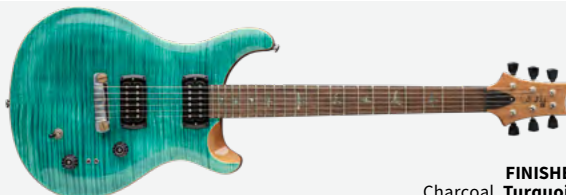
FINISHES: Charcoal, Turquoise

Flame maple veneer (McCarty Tobacco) or maple top (Gold Top), shallow violin carve, mahogany back, 25" scale length, 22 fret mahogany neck, rosewood fretboard, PRS patented tremolo, DGT "S" treble and bass pickups, 2 volume controls with push/pull tone control and 3-way toggle pickup switch, PRS-Designed tuners, nickel hardware, gig bag