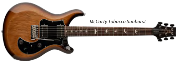
McCarty Tobacco Sunburst