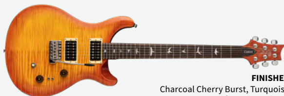
FINISHES: Charcoal Cherry Burst, Turquoise, Vintage Sunburst

Maple top with flame maple veneer, shallow violin carve, mahogany back, 25" scale length, 24 fret maple neck, ebony fretboard, bird inlays, Floyd Rose tremolo, 85/15 "S" treble and bass pickups, volume & push/pull tone controls with 3-way blade pickup switch, PRS-Designed tuners, nickel hardware, gig bag