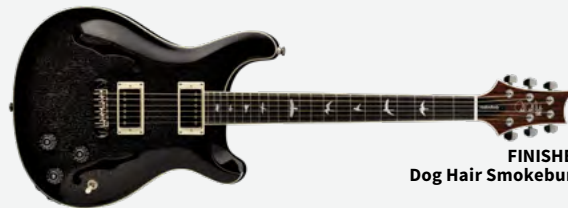
FINISHES: Dog Hair Smokeburst