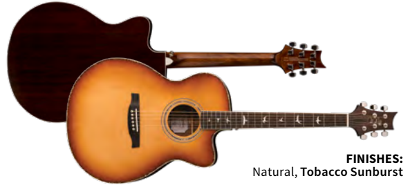
FINISHES: Natural, Tobacco Sunburst