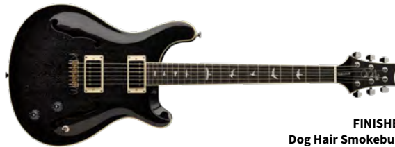
FINISHES: Dog Hair Smokeburst