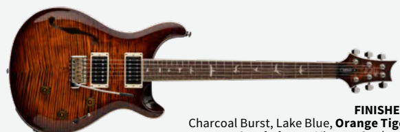
FINISHES: Charcoal Burst, Lake Blue, Orange Tiger Smokeburst , Vintage Sunburst