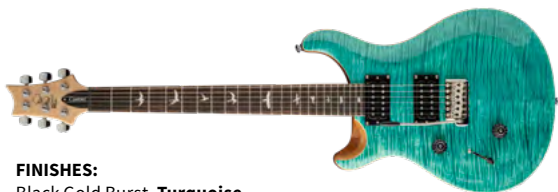
FINISHES: Black Gold Burst, Turquoise

Maple top with flame maple veneer, shallow violin carve, mahogany back, 25" scale length, 24 fret maple neck, rosewood fretboard, bird inlays, PRS patented tremolo, TCI "S" treble and bass pickups, volume and tone controls with 3-way toggle pickup switch & two mini-toggle coil-split switches, PRS-Designed tuners, nickel hardware, gig bag