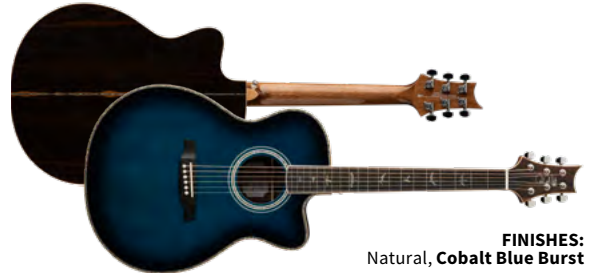
FINISHES: Natural, Cobalt Blue Burst