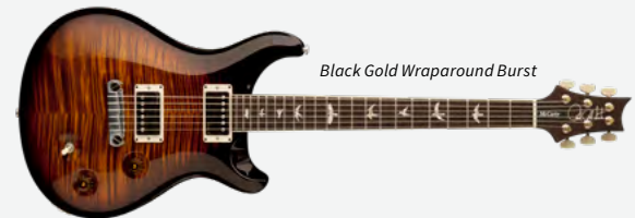
Black Gold Wraparound Burst

Carved figured maple top, mahogany back, 24.594" scale length, 22 fret mahogany neck, rosewood fretboard with faux bone binding, bird inlays, rosewood headstock veneer with inlaid signature, McCarty III treble and bass pickups, volume & push/pull tone controls for each pickup with 3-way toggle pickup switch on upper bout, PRS two-piece bridge, PRS Phase III non-locking tuners w/ wing buttons, nickel hardware, hardshell case