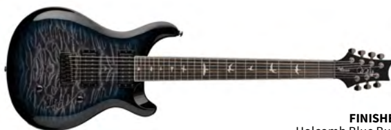
FINISHES: Holcomb Blue Burst

Maple top with flame maple veneer, shallow violin carve, mahogany back, 25" scale length, 22 fret mahogany neck, rosewood fretboard, bird inlays, PRS stoptail with brass inserts, TCI "S" treble and bass pickups, volume & tone controls with 3-way toggle pickup switch & two mini toggle coil-split switches, PRS-Designed tuners, nickel hardware, gig bag