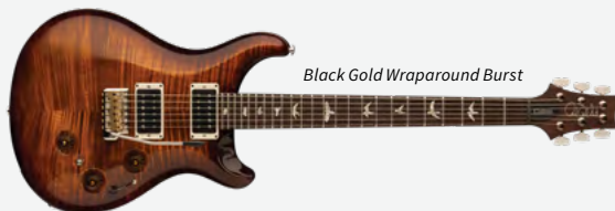
Black Gold Wraparound Burst

Carved figured maple top, mahogany back, 25" scale length, 24 fret maple neck, ebony fretboard, PRS jumbo frets, bird inlays, ebony headstock veneer with inlaid signature, \ m / treble & bass pickups, volume & tone controls with 5-way blade pickup switch, Floyd Rose "original" tremolo & locking nut, PRS Phase III non-locking tuners w/ wing buttons, nickel hardware, hardshell case