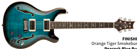
FINISHES: Orange Tiger Smokeburst, Peacock Blue Burst