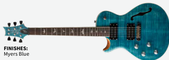
FINISHES: Myers Blue

Beveled maple top with flame maple veneer, mahogany back, 24.594" scale length, 24 fret mahogany neck, rosewood fretboard, bird inlays, PRS patented tremolo, Santana "S" pickups, volume & tone controls with 3-way toggle pickup switch, PRS-Designed tuners, nickel hardware, gig bag