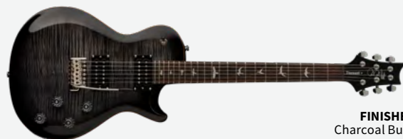
FINISHES: Charcoal Burst

Maple top with single F-hole and flame maple veneer, shallow violin carve, mahogany back, 24.594" scale length, 22 fret bound mahogany neck with satin finish, flame maple bound headstock veneer, bound rosewood fretboard, bird inlays, PRS adjustable stoptail, 245 "S" treble and bass pickups, volume & tone controls for each pickup with 3-way toggle pickup switch on upper bout, vintage-style tuners, nickel hardware, gig bag