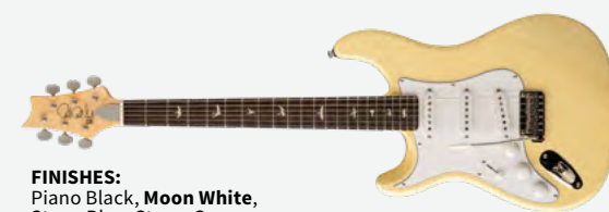
FINISHES: Piano Black, Moon White , Stone Blue, Storm Gray

Poplar body, 25.5" scale length, 22 fret maple neck, maple fretboard, small bird inlays, PRS 2-point steel tremolo, 635JM "S" treble, middle, and bass single-coil pickups, one volume & two tone controls with 5-way blade pickup switch, vintage-style tuners, nickel hardware, gig bag