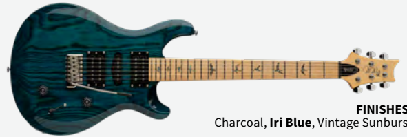
FINISHES: Charcoal, Iri Blue , Vintage Sunburst

Swamp ash body, shallow violin carve, 25" scale length, 22 fret maple neck, maple fretboard, bird inlays, PRS patented tremolo, 85/15 "S" treble & bass pickups, PRS-Designed AS-01 single coil middle pickup, volume and push/pull tone control w/ 5-way blade pickup switch, PRS -Designed tuners, nickel hardware, gig bag • Neck profile: wide thin