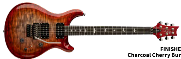
FINISHES: Charcoal Cherry Burst

Maple top with quilted maple veneer, shallow violin carve, mahogany back, 25" scale length, 24 fret maple neck, ebony fretboard, bird inlays, PRS patented tremolo, 85/15 "S" treble & bass pickups, volume & push/pull tone control with 3-way blade pickup switch, PRS-Designed tuners, nickel hardware, gig bag