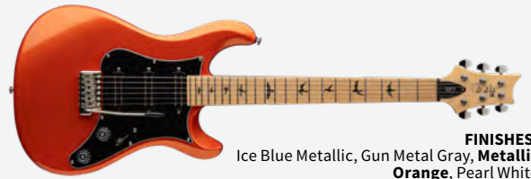
FINISHES: Ice Blue Metallic, Gun Metal Gray, Metallic Orange , Pearl White

Poplar Body, 25" scale length, 22 fret maple neck, maple fretboard, bird inlays, PRS patented tremolo, PRS Narrowfield DD "S" treble/middle/bass pickups, volume & tone control with 5-way blade pickup switch, PRS Designed tuners, nickel hardware, gig bag • Neck profile: wide thin