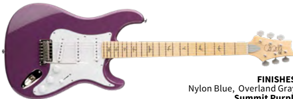
FINISHES: Nylon Blue, Overland Gray, Summit Purple

Poplar body, 25.5" scale length, 22 fret maple neck, rosewood fretboard, small bird inlays, PRS 2-point steel tremolo, 635JM "S" treble, middle, and bass single-coil pickups, one volume & two tone controls with 5-way blade pickup switch, vintage-style tuners, nickel hardware, gig bag