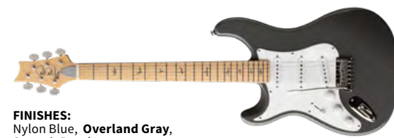
FINISHES: Nylon Blue, Overland Gray , Summit Purple