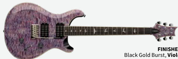
FINISHES: Black Gold Burst, Violet

Maple top with quilted maple veneer, shallow violin carve, mahogany back, 25" scale length, 24 fret maple neck, ebony fretboard, bird inlays, PRS patented tremolo, TCI "S" treble and bass pickups, volume and tone controls with 3-way toggle pickup switch & two mini-toggle coil-split switches, PRS-Designed tuners, nickel hardware, gig bag