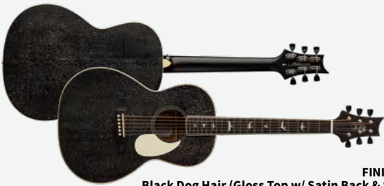
FINISHES: Black Dog Hair (Gloss Top w/ Satin Back & Sides) Fire Red Burst (Gloss Top w/ Satin Back & Sides)