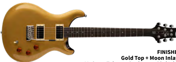
FINISHES: Gold Top + Moon Inlays, McCarty Tobacco Sunburst + Bird Inlays