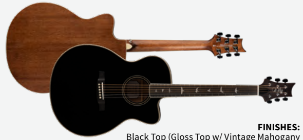
FINISHES: Black Top (Gloss Top w/ Vintage Mahogany Satin Back & Sides)