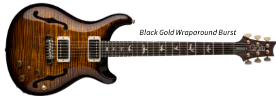
Black Gold Wraparound Burst

Antique White Top*, Aurora Borealis, Black Gold, Black Top*, Gold Top*, Black Gold Wraparound Burst, Charcoal, Charcoal Burst, Dark Cherry Sunburst, Faded Blue Jean Gray Black, McCarty Sunburst, McCarty Tobacco Sunburst, Red Tiger