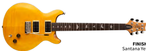
FINISHES: Santana Yellow

Maple top with quilted maple veneer, shallow violin carve, mahogany back, 25.5" scale length, 24 fret bound maple neck with satin finish, ebony fretboard, bird inlays, plate style bridge (string through), Seymour Duncan Holcomb "Scarlet and Scourge" bass and treble pickups, volume & push/pull tone controls with 3-way blade pickup switch, PRS-Designed tuners, black chrome hardware, gig bag (Ships Tuned to Drop C)